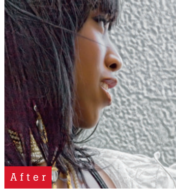
Adding Warmth and Detail: The image on the left started with a digital capture with my Nikon D200 on the streets of San Francisco. It was a nice sunny day between two buildings so we had a lot of open blue fill. Although our model has struck a nice strong pose, the light spilling across her face shows her pore structure. In Lightroom, I made basic white balance and exposure adjustments to suit the feel I wanted to create. Then, using Lightroom's Edit In function, I started working on this image in Photoshop CS4. In Photoshop, I made a duplicate layer, then ran Noiseware on the duplicate layer. While Noiseware does a great job of correcting an image in the default mode, I prefer making noise adjustments based on my eye and knowledge of the shoot conditions. Then, I used Portraiture to smooth the pores and add warmth back into the model's skin.